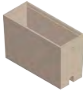
Universal 8 Slotted Pit (No floor) Product Code 524140S