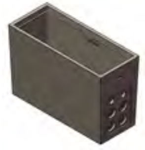
Universal 8 Pit Product Code 524140