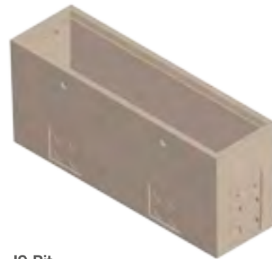
J9 Pit Product Code 524190 Approved Pit