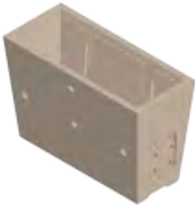
J8 Pit Product Code 524160 Approved Pit